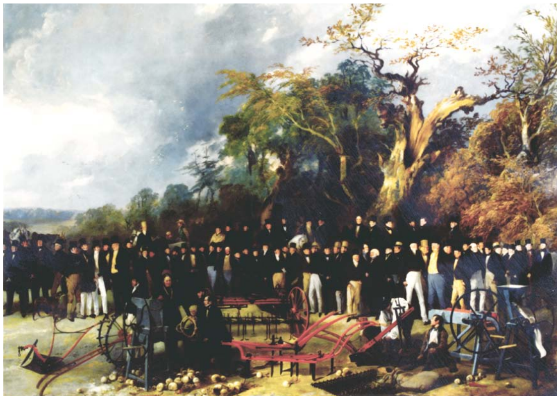
Right-hand side detail

This magnificent oil painting of 'The Country Meeting of the Royal Agricultural Society of England' by Richard Ansdell (1815–1885) is 16 feet wide and depicts 127 gentlemen at the trial of implements at Bristol in 1842.