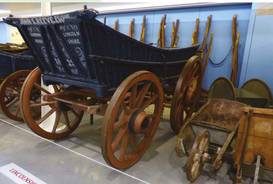
One of the many wagons in the wagon walk

The main impression gained through the well presented displays is of the wealth and variety of the Museum's collection. The highlight of the exhibitions has to be the Museum's unique collection of wagons from across England, all lined up in the 'Wagon Walk'. These mostly resulted from collecting by early curator, Geraint Jenkins, and provided material for his definitive book on the subject. This might have presented a rather dry experience, but with the help of a series of illustrations and information panels giving the history of some of the exhibits as well as the reasons for regional differences beside small displays of wheelwrights', and wainwrights' tools all accompanied by sound effects of rumbling wagons and their builders' workshops, the whole experience is an inspiring and informative one.