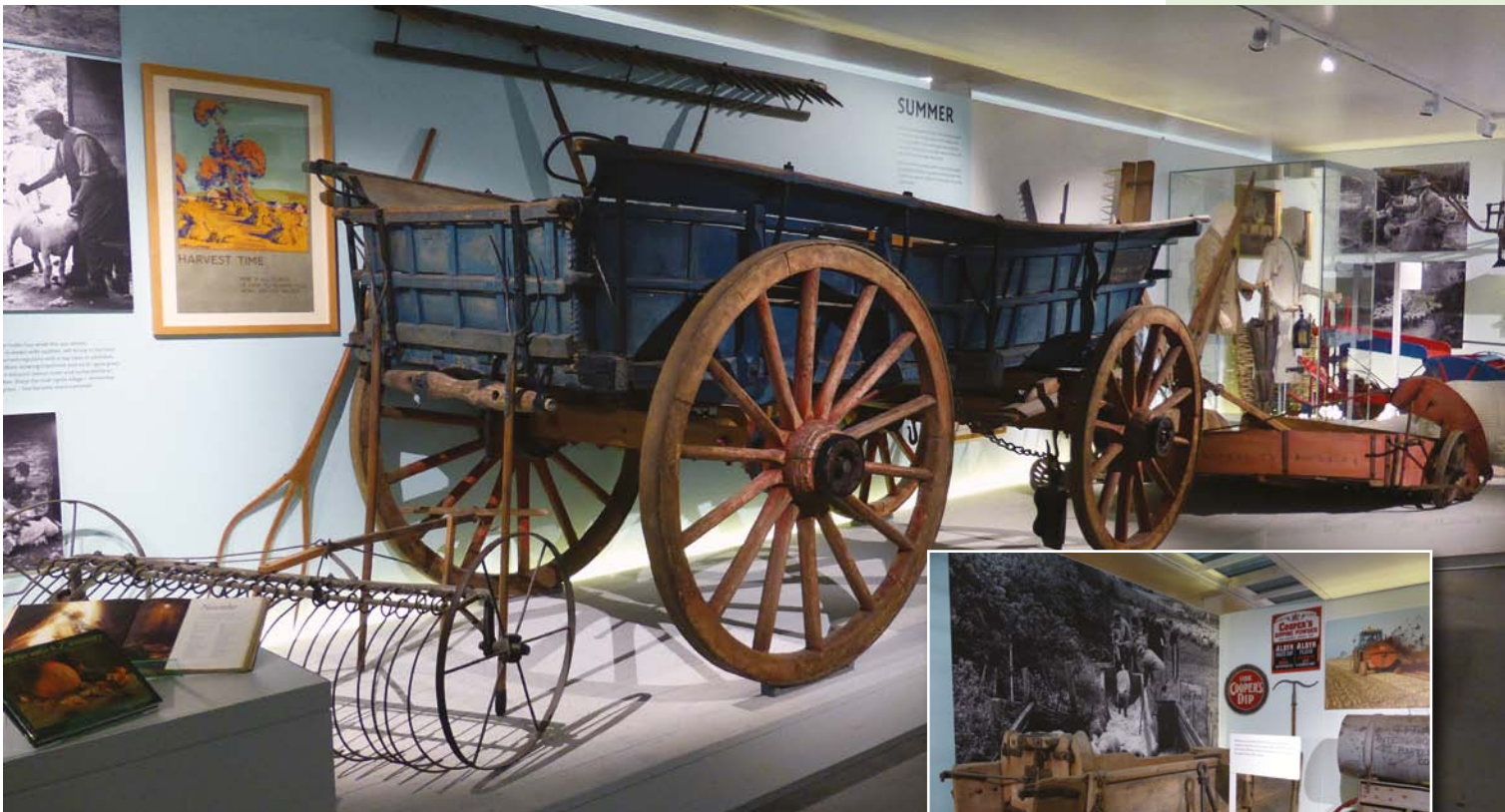
Above and right: Parts of the farming year displays on hay making and sheep dipping in the summer