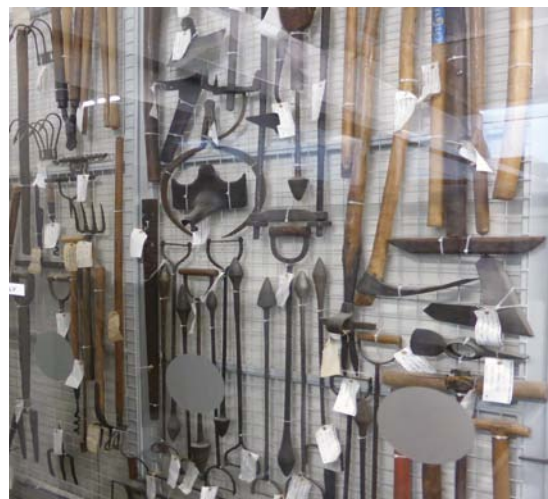
Handheld implements in the Museum's stores as viewed through glass doors

The ability to wander through the glass-fronted museum stores situated on a second floor allows the full extent of the object collection to be appreciated.