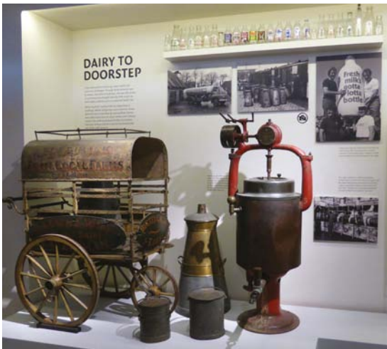
Left: The dairy display including a huge range of milk bottles.