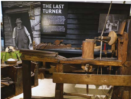
Left and below: Two of the craft displays on wood turning and basket making